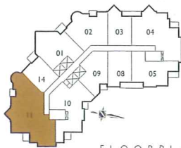
FLOORPLATE 25th FLOOR

Materials, specifications and floorplans are subject to change without notice, E. & O.E., May 1999. Tridel is a registered trademark of Tridel Corporation.