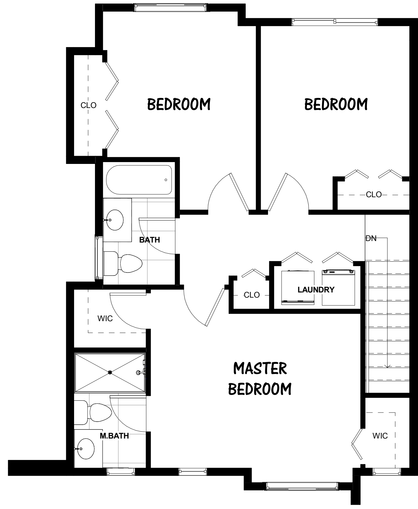
3 TYPE E1 - LEVEL 3 1/4" = 1'-0" FLOOR AREA = 70.03m 2 / 753.80 SF