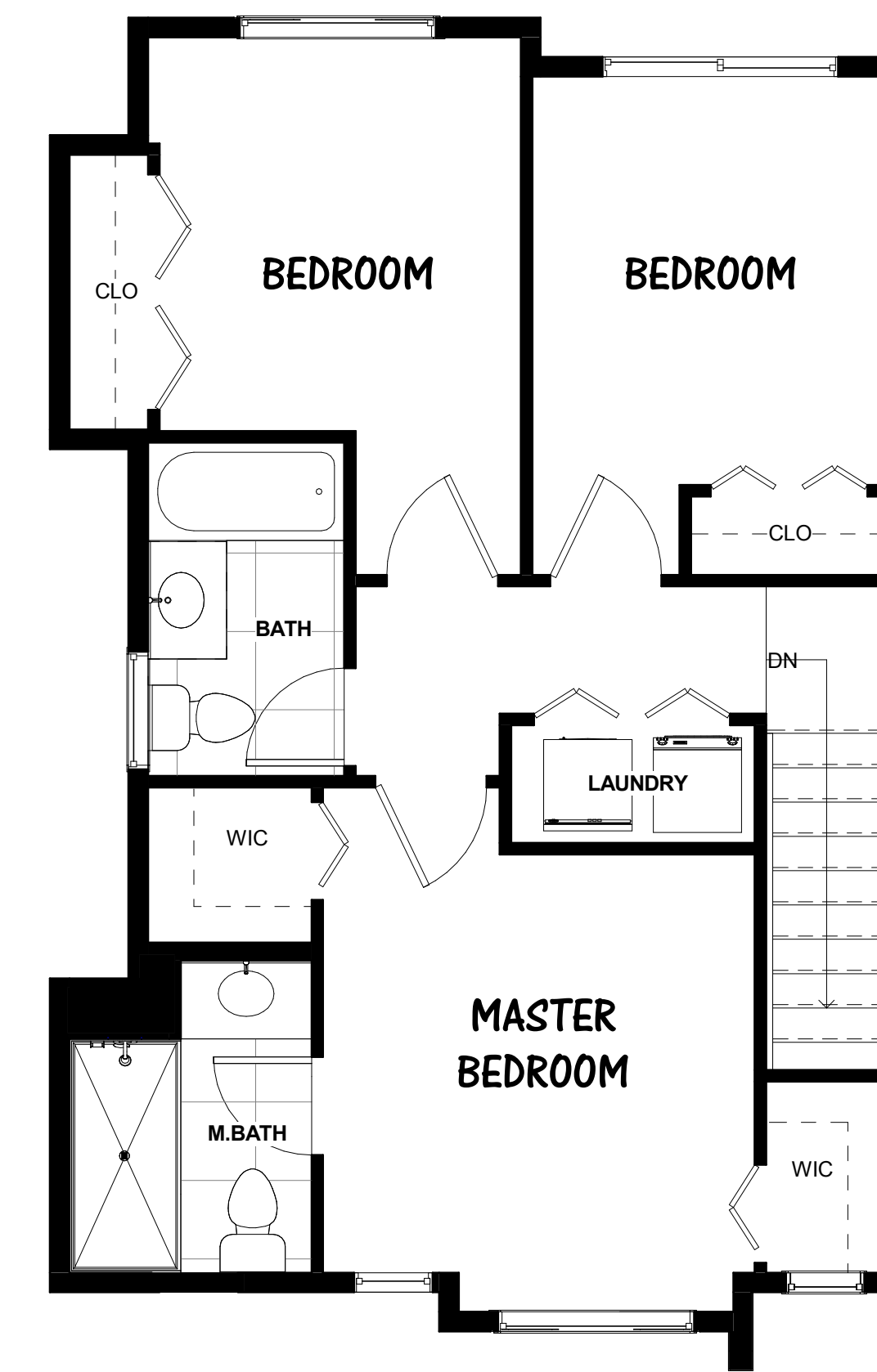
3 TYPE A1 - LEVEL 3 1/4" = 1'-0" FLOOR AREA = 62.26m 2 / 670.16 SF