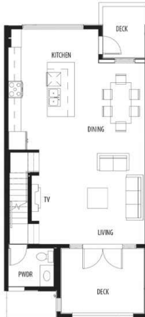
FIRST FLOOR 702 S.F.