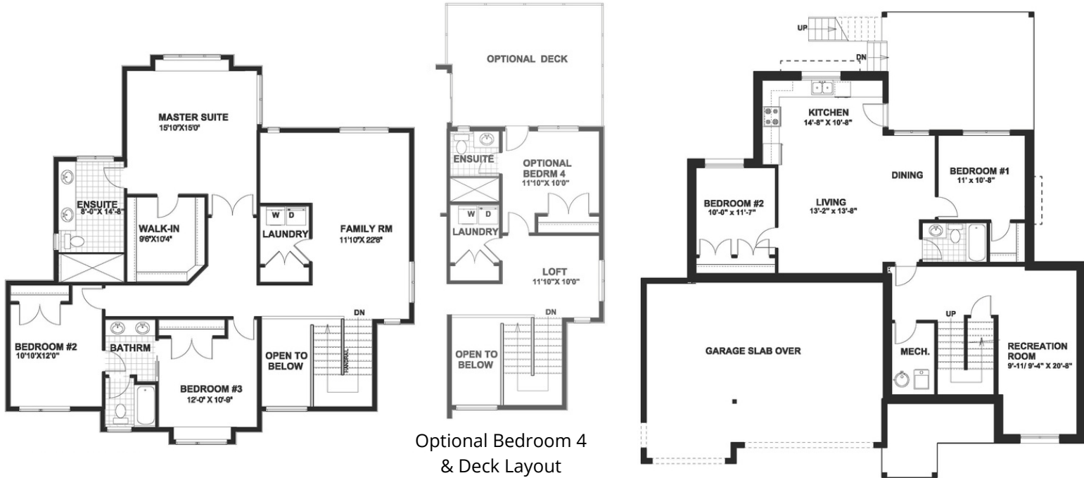
Upper Floor* 1700 sq.ft