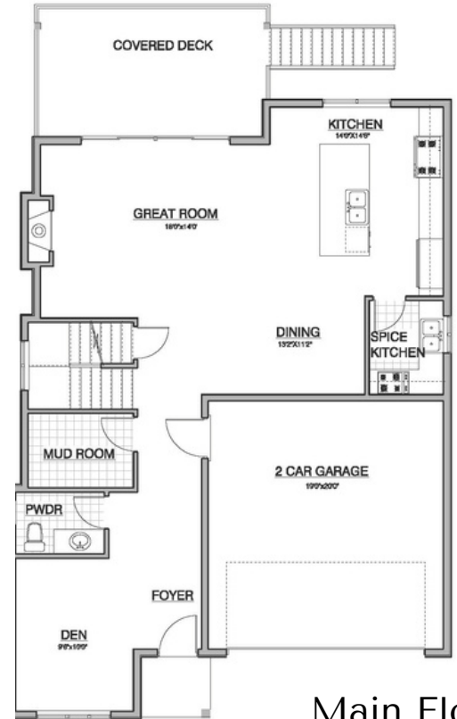
Main Floor 1141 sq.ft