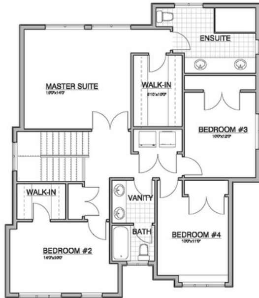
Upper Floor 1242 sq.ft