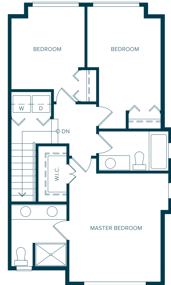
UPPER 709 s.f.