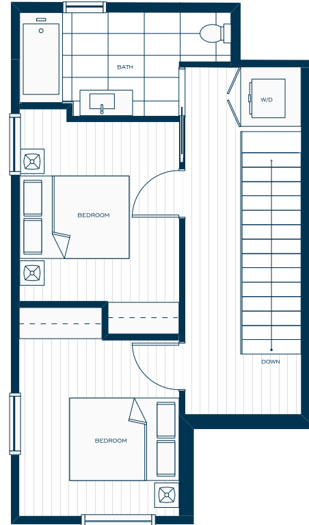
■ SECOND FLOOR

Total 1656 ft 2 Exterior 60 ft 2 Interior 1596 ft 2 03 Bedroom + 2.5 Bathroom + Attic + Garage